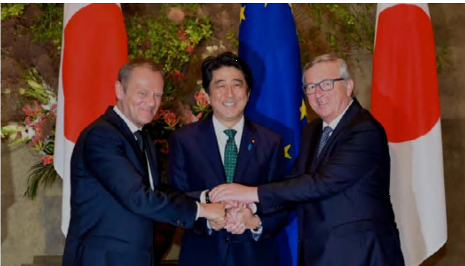
Photo: (l-r) Donald Tusk, the Japanese Prime Minister Shinzo Abe and Jean-Claude Juncker at the 23th EU-Japan Summit

On 29 May 2015, Mr Shinzo Abe, Prime Minister of Japan, Mr Donald Tusk, President of the European Council, and Mr Jean-Claude Juncker, President of the European Commission, met in Tokyo for the 23 rd Summit between Japan and the European Union (EU) and endorsed the joint vision on the new strategic partnership in Research and Innovation between the European Commission and the Government of Japan (see joint press statement ).