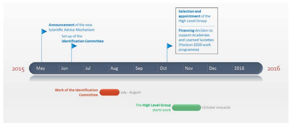
Figure 1.2: Timeline for the set-up of the Scientific Advisory Mechanism: May to December 2015.

In the coming months, Commissioner Moedas’ task will be to implement this new arrangement involving other Commissioners and making the most of effective cooperation between Commission services. The figure below is taken from the NCP Brussels website 6 , indicating the envisioned timeline for the set-up of the Scientific Advisory Mechanism until autumn 2015.