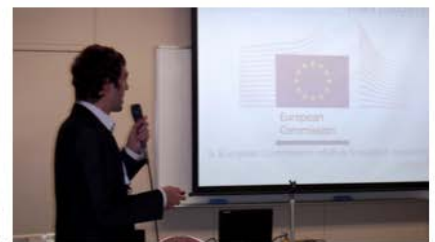
... Then we presented EURAXESS' role and services ...