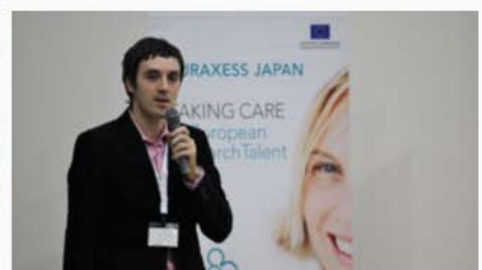
... we also seized the opportunity to present EURAXESS to you all! ...