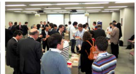
... than expected!!

We hope the event was of interest for you all! See you again, and おおきに!