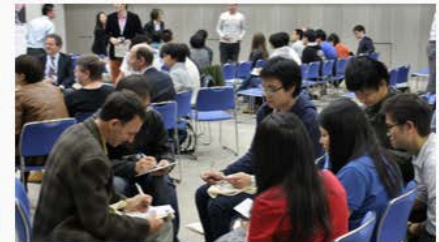
... Everyone's preparing their arguments for the debating and voting sessions ...