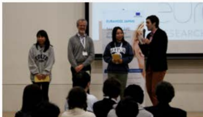
... Participation prize for everyone ...