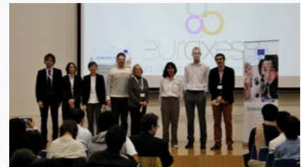
... Thanks to the Jury members, who animated the debating sessions, everyone was happy with the results! ...