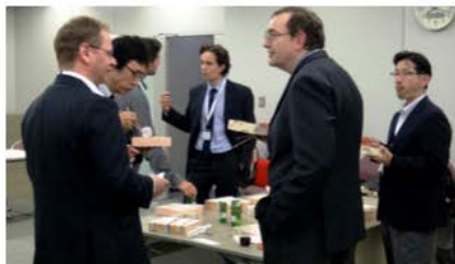
... a bit longer ...