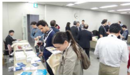
... to whom we offered a variety of documents and goods ...