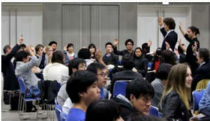
... Several methods! Raising hands ...