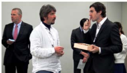
... The networking session went on for longer ...