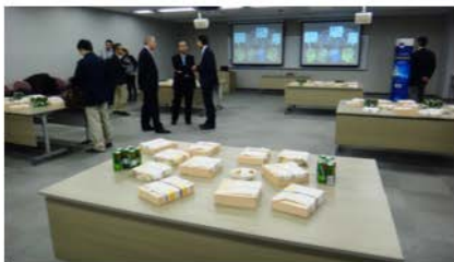
The very nice venue, in the heart of Osaka, being prepared for the event...

Check the pictures of the event, available on our external website: http://sharekansai2014.splashthat.com/