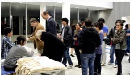
Maybe the most popular wait line in Tokyo on this day...