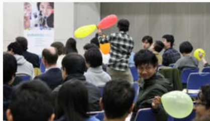
... Share ballots - errr, balloons ...