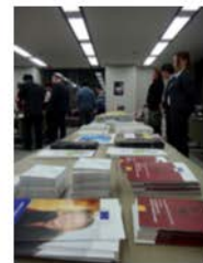
...relevant for Europe-Japan cooperation in research, of course! ...