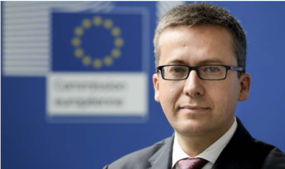
Carlos Moedas, the newly appointed Commissioner for research, science and innovation

On 22 October, the European Parliament gave its strong support to the new European Commission . Following the European Council's appointment, the new Commission took office on 1 November. In the Political Guidelines presented in Strasbourg in July, President Juncker stressed the importance of research and innovation (R&I) for job creation and economic growth. International cooperation in research and innovation was stressed by President Juncker, who expects the European Union to confirm its position as a global actor.