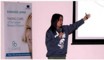
... Now the Slams start! The first to go is Ms