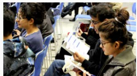
...and attendees discover today's programme, along with documentation on European Research opportunities...