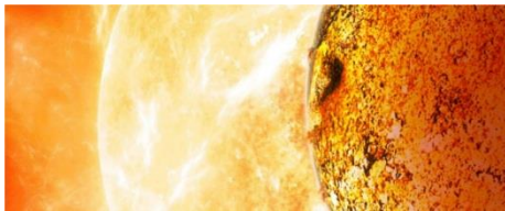
An artist's impression of the planet Kepler-78b. The planet circles its star every eight and a half hours at a distance of less than 1.6 million kilometres. The proximity of Kepler-78b to its parent star leads to temperatures so high as to melt the rock on its surface and strip away its atmosphere.

Read this thought-provoking interview on the Horizon website .